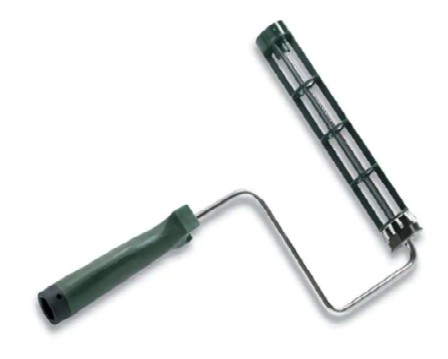
You will need a roller handle with the metal control tabs, don't try to save money here, you will lose.